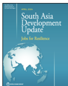
South Asia Development Update April 2024: Jobs for Resilience