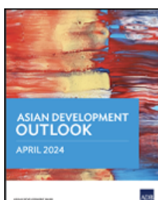
Asian Development Outlook April 2024