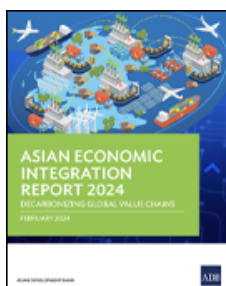
Asian Economic Integration Report 2024