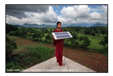
SciDev South Asia