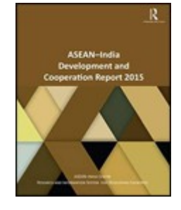
ASEAN-India Development and Cooperation Report 2015