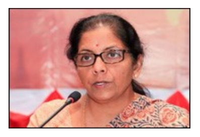
India Embassy Yangon