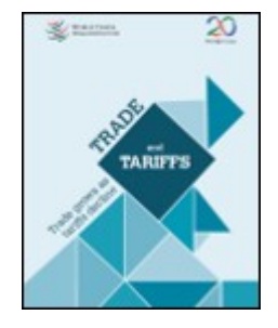
Trade and Tariffs: Trade Grows as Tariffs Decline