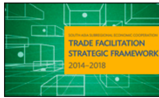
SASEC TRADE FACILITATION STRATEGICAL STRATEGY