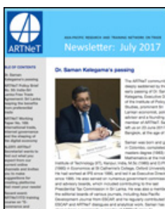
Artnet Newsletter - July 2017