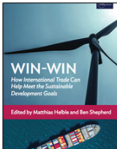
Win-Win: How International Trade Can Help Meet the Sustainable Development Goals