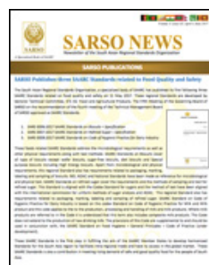
SARSO News: Vol. 31, No. 2