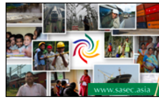
SASEC WEBSITE BROCHURE