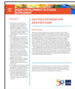
Asian Development Outlook 2017 Supplement: Cautious Optimism for Asia's Outlook