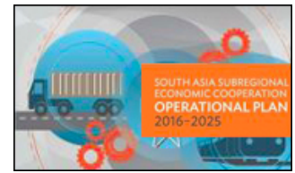
SASEC OPERATIONAL PLAN 2016-2025