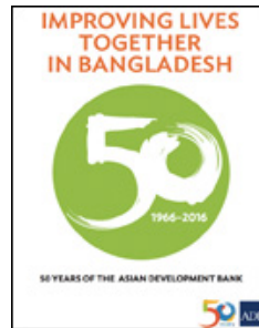
Improving Lives Together in Bangladesh: 50 Years of the Asian Development Bank