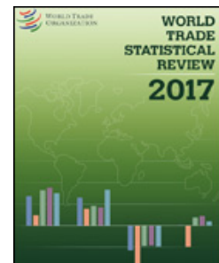
World Trade Statistical Review 2017