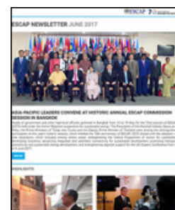
ESCAP Newsletter - June 2017