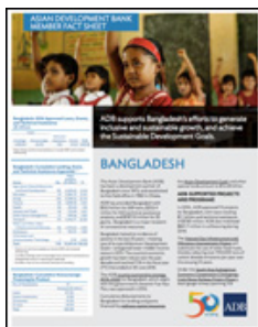
Asia Development Bank and Bangladesh: Fact Sheet