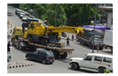
• Kuensel Online