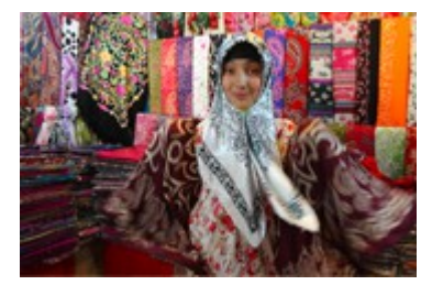
• The Financial Express