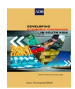
Developing Economic Corridors in South Asia