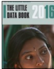
The Little Data Book 2016