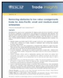
Removing Obstacles to Low Value Consignments Trade for Asia-Pacific Small and Medium-sized Enterprises