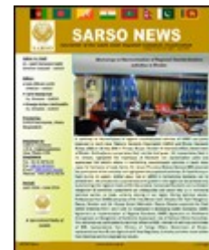
SARSO News: Volume 2, Issue 2