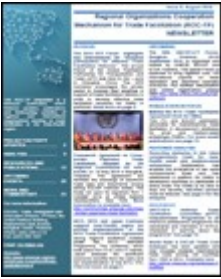
Regional Organizations Cooperation Mechanism for Trade Facilitation Newsletter: Issue X, August 2016