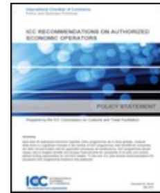
ICC Recommendations on Authorized Economic Operators

See more publications on regional cooperation in South Asia and other regions at http://www.sasec.asia/publications.php