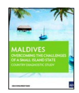
Maldives: Overcoming the Challenges of a Small Island State – Country Diagnostic Study