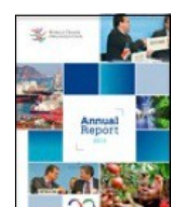
World Trade Organization Annual Report 2015