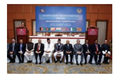
• The Daily Star